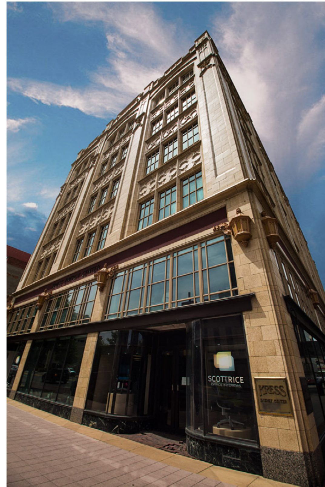
NW CORNER OF DOUGLAS & BROADWAY